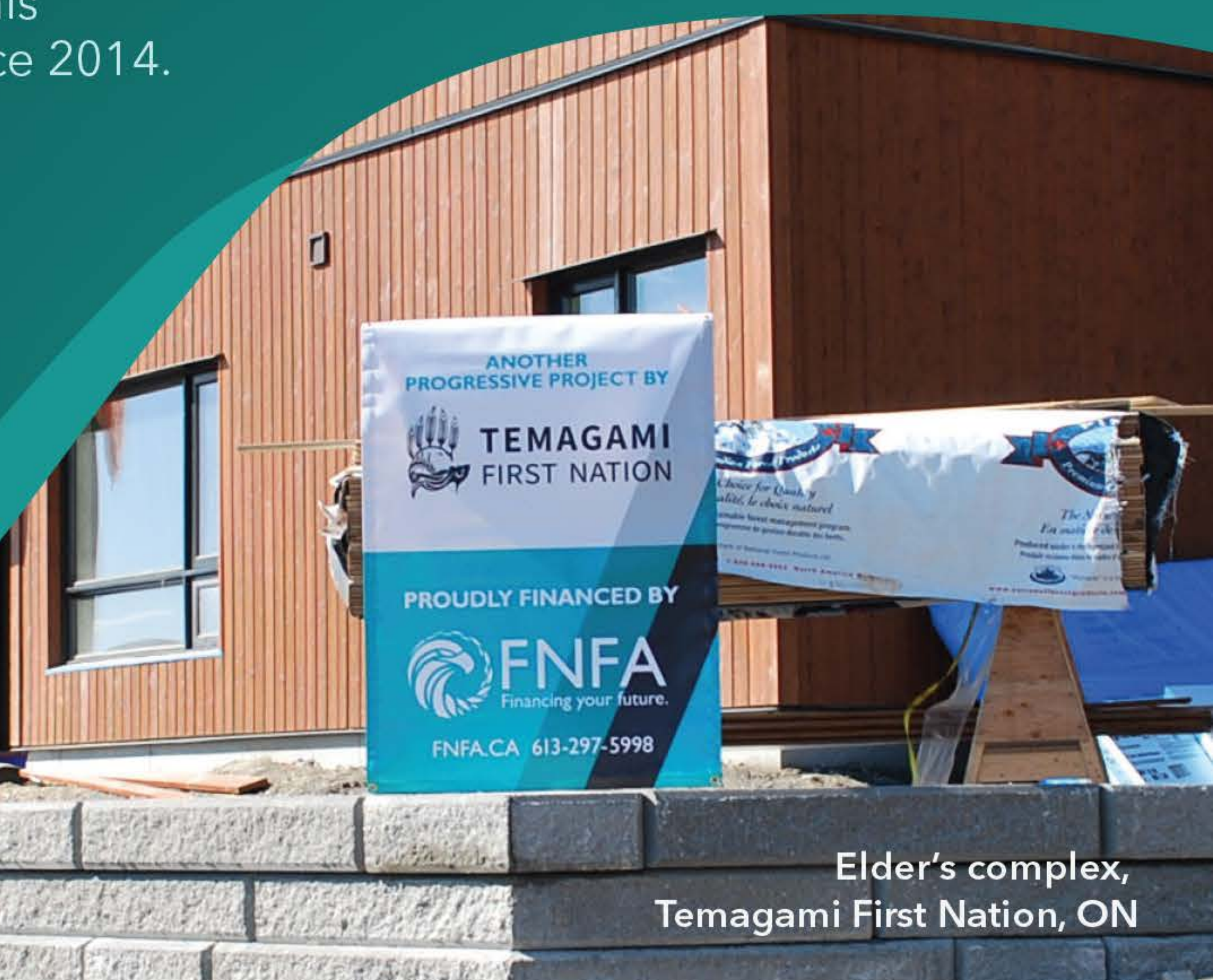
Elder's complex, Temagami First Nation, ON