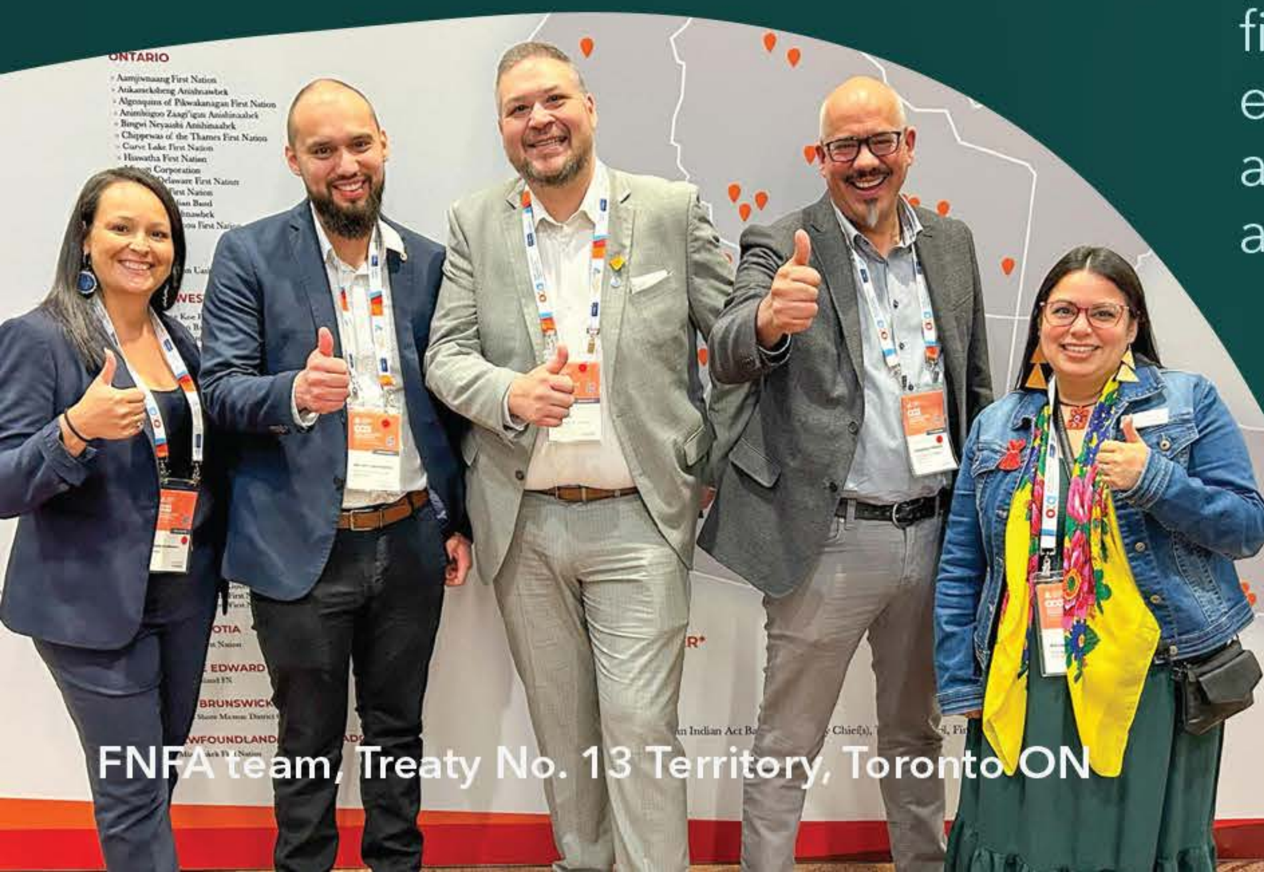
FNFA team, Treaty No. 13 Territory, Toronto ON

FNFA does not charge fees, our interest rates are well below bank prime, and we provide longer financing terms. Our objective is to ensure continuous and equal access to affordable financing for all First Nations in Canada.