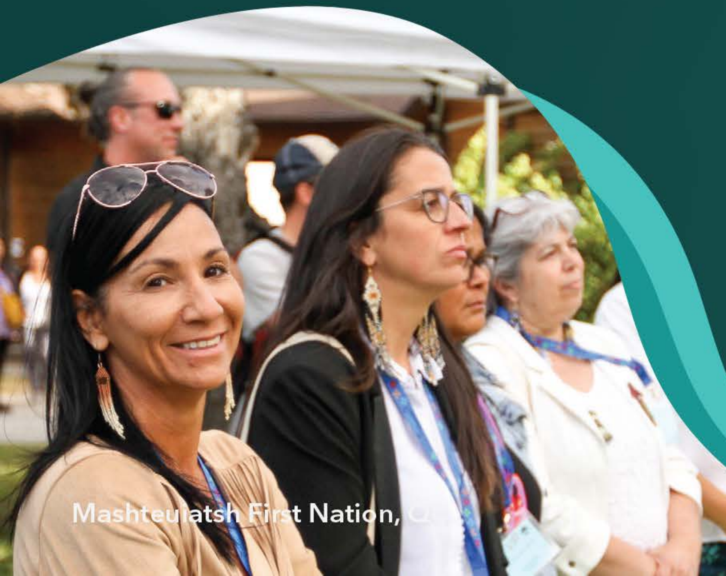
Mashteuiatsh First Nation, Ontario